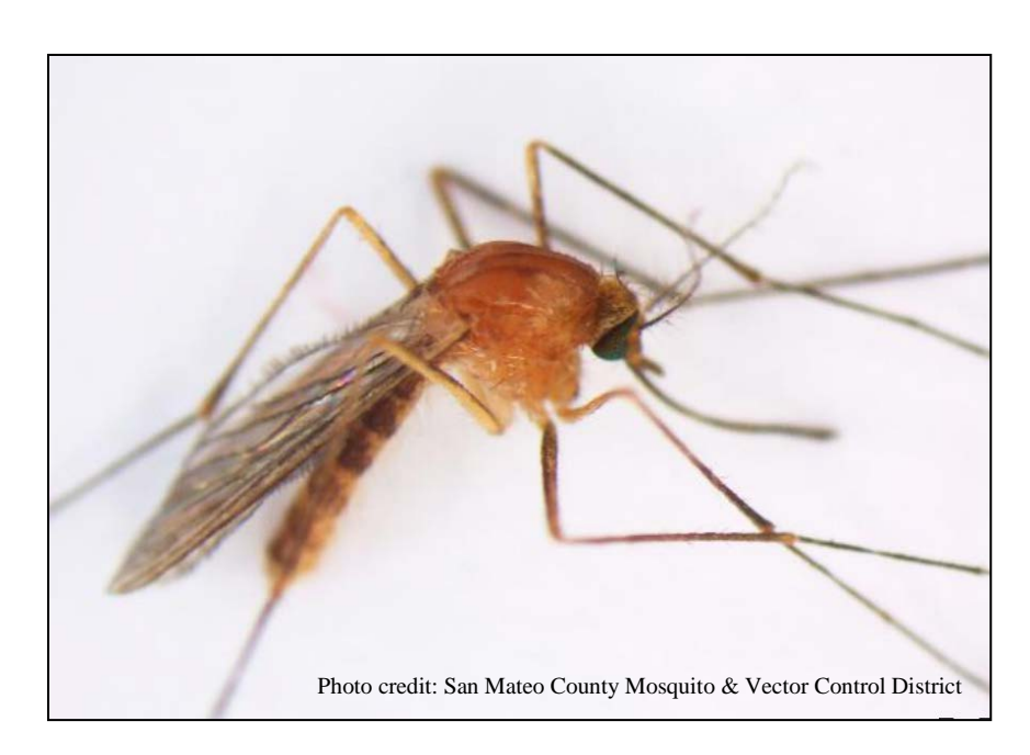
Tule mosquito, Culex erythrothorax

This reddish-orange mosquito with golden-yellow stripes on the abdomen is common in our region at many wetland sites such as the Andrée Clark Bird Refuge, Lake Los Carneros, Goleta Slough, and SB Airport marshes. It is known as the "tule mosquito" because females lay their eggs and the immatures complete their development in wetlands with dense stands of cattails and tules growing out of the water. Females bite at night seeking blood from birds and mammals, including humans, but do not fly far from their breeding sources. While the tule mosquito is known to carry West Nile Virus, it is not considered to be a strong vector. The tule mosquito overwinters in the larval stage, which differs from many other Culex species that spend the winter as adults.